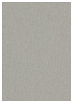
Kicker Brushed Silver