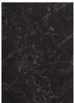
Benchtop Darkside Marble

Generous sized benchtops make the most of the galley space and add a strong sense of style thanks to their luxurious looking Darkside Marble finish. Dark wooden floors, stainless steel handles and kickers in Brushed Silver perfectly complement this traditional kitchen's materials and style.