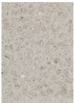
Benchtop Terrance Pearl

Use subtle metallic accents that mirror the Brushed Silver kicker and for a luxurious edge use metallic accents, like appliances or fittings, that tap into the Brushed Silver kicker and Graphite cabinetry. If your space has limited windows, add a skylight, overhead lights, or white floor for brightness, or timber-look floors to balance the deep colour palette.